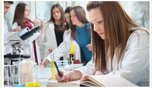
OrthoWorx is studying ways to advance Science, Technology, Engineering and Mathematics (STEM) education in the region.

Enhancing the area's educational offerings to better meet the academic needs of students will help to ensure a well-educated workforce. It will also make the community more attractive for those living in and also considering relocation to this area. As part of the OrthoWorx Education Initiative, we are studying ways to advance Science, Technology, Engineering and Mathematics (STEM) education in the region, with a goal of leveraging the orthopedic industry's world-class expertise in these subject areas.