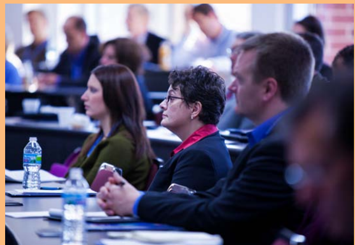
OrthoWorx hosted the Indiana Life Sciences Collaboration Series Conference at The Orthopaedic Capital Center in Winona Lake, Ind.

As part of this initiative, OrthoWorx sponsored and hosted the Indiana Life Sciences Collaboration Conference Series. Coordinated by the IU Kelley School of Business Center for the Business of Life Sciences, the conference series examines existing and emerging mechanisms to maintain and increase the momentum that has been building in life sciences in Indiana. It also provides an opportunity to share the latest thinking and spark discussion on topics relevant to the life sciences industry.