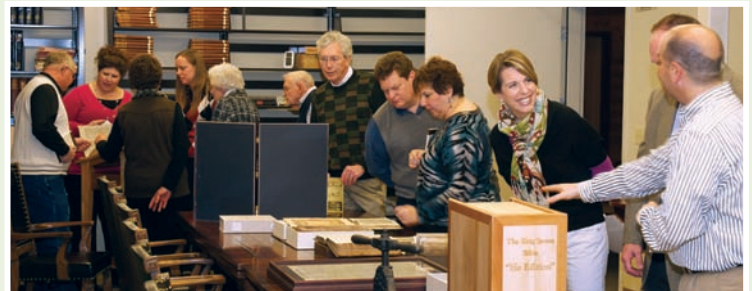
Inside The Vault at The Remnant Trust

The OrthoWorx Community Enhancement Initiative is focused on building upon, expanding and helping to promote the social, recreational and cultural offerings in the community. We continue to support community enrichment in partnership with The Remnant Trust, providing community access to its historical document collection.